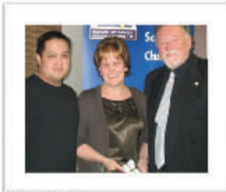
2011 - Excellence in Teaching - Award Nominee

extend a thank you to the Teachers that inspire students to create their WORKS of ART . School Art continues to be on display at the Esplanade Gallery until April 17, 2011. Gallery Hours: M-F 10am-5pm; S&S Noon-5pm; Admission: $4 Adults; $7 Youth; Free under 6. Thursdays are Free Admission.